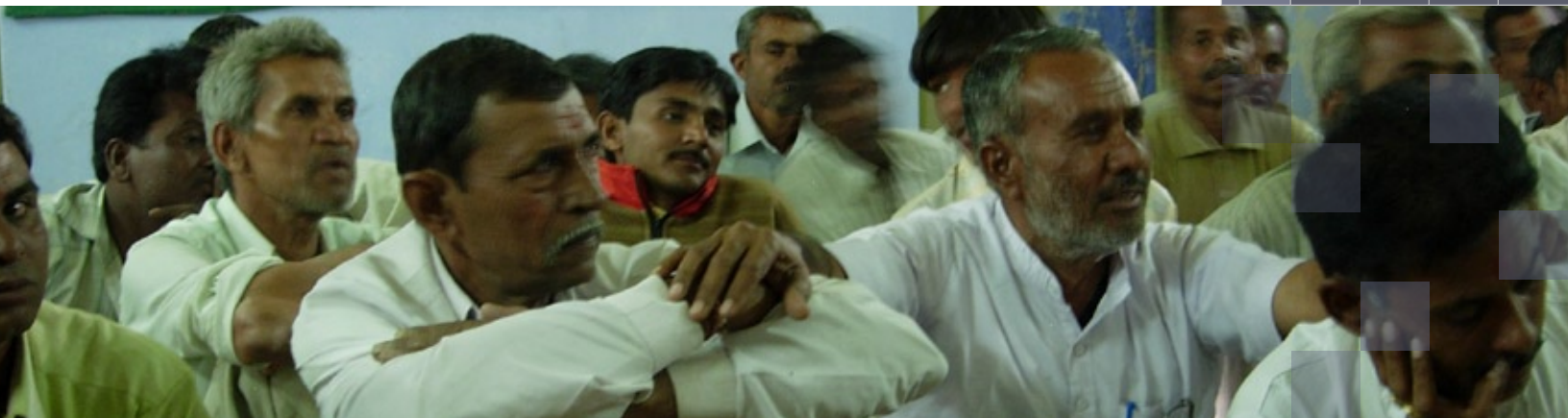
Project work aims to benefit farmers facing risks from an uncertain monsoon; Surendranagar district, Gujarat.

“Forecasting the monsoon is quite complex, especially at 1-to-2-month lead times or sub-national scales. And climate information alone isn’t enough. It needs to be connected with decision opportunities, enabled by local institutions and sufficient resources for action by farmers.”