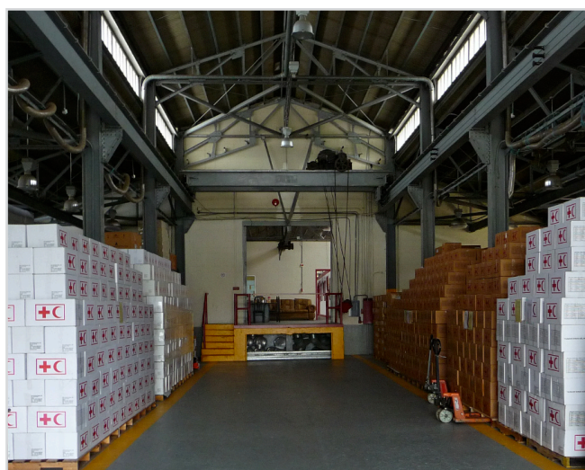
Brian Kahn (2009)

IFRC offices are used to managing the uncertainty in short-term forecasts. Longer-term forecasts, however, are more difficult to translate into action. For example, many offices at the national and community level have a hard time envisioning how a forecast for 50% chance of 'above-normal' rainfall over the southeastern corner of their continent over the next 3 months could serve as a warning that translates into operational decisions on the ground. With the larger uncertainty of precipitation forecasts and their rather tentative connection to actual