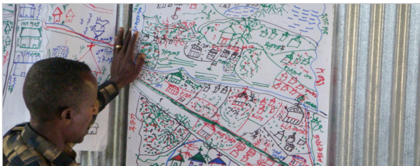
Ujala Qadir (2009)