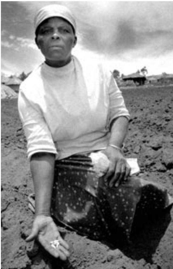
Farmers won't invest if there is a high risk of crop failure; C. Hughes/Panos Pictures

Malawi is one of Africa's poorest countries, with 65% of its population of 12 million living below the poverty line and a per capita GDP of only US$ 200. It is also a very rural country, with over 80% of its people engaged