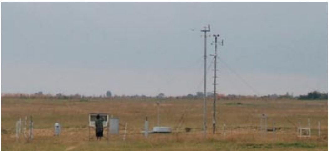
Participating farmers had to live within 20 km of a meteorological station

Another complication that arose during the season was poor seed quality. A middle-man working for a commercial seed company sold expired seeds that did not germinate. This provided an interesting test of the project's acceptability to the farming community, since this is exactly the kind of thing the insurance scheme does not cover. Farmers showed that they understood the scheme, since they did not demand payouts from it but instead put pressure on the seed company.