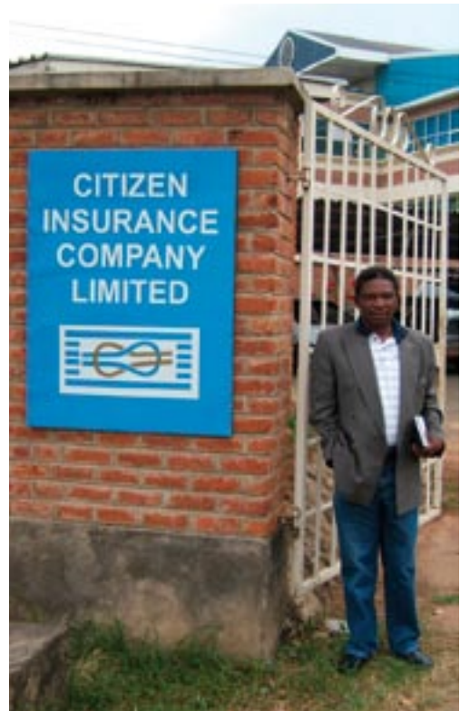
Malawi's insurance companies are collaborating as a consortium

Malawi's drought insurance project began with a stakeholders' meeting organized by the World Bank in July 2005. Stakeholders realized the potential of the new concept and expressed their interest in participating in a