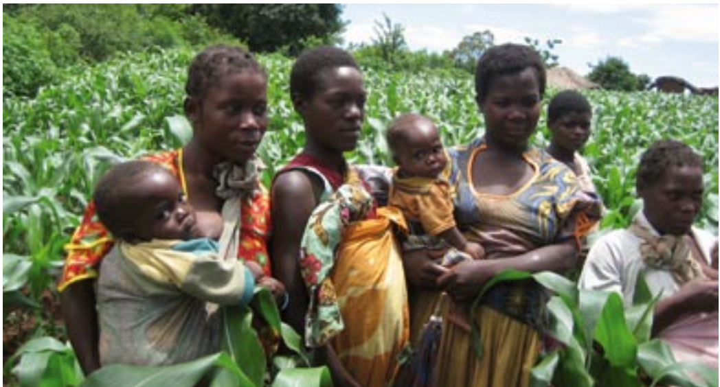
Including maize will pose new challenges

In the longer term, it is planned to engage a broader range of participants. This may include commercial farmers, in addition to a more diverse array of input suppliers and