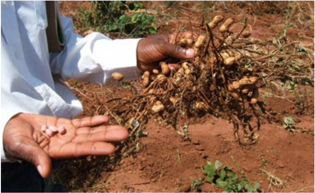
Groundnut was chosen as a test crop for the pilot phase

The next step was to identify the sites for the pilot phase. Four sites were selected, based on NASFAM presence, groundnut production, and proximity to a meteorological station (see Figure 12). Consultations with the meteorological service, the extension service, and farmers suggested that farmers within 20 km of a station would experience roughly the same rainfall patterns as the station itself. Thus, during the pilot phase, only farmers who were within this radius were insured.