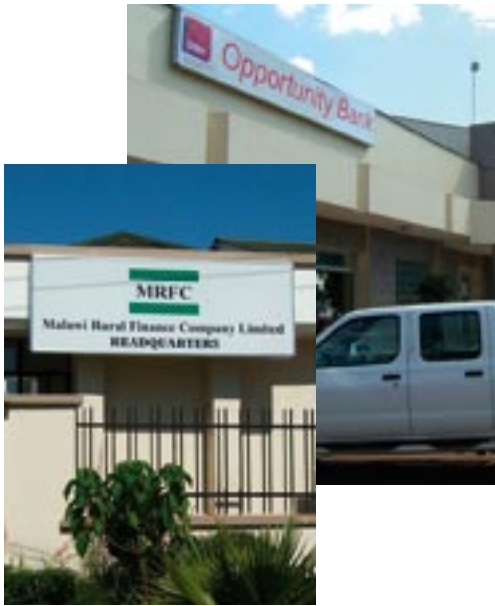
Two finance companies are providing micro-credit

companies are participating as a consortium, the Insurance Association of Malawi. Once the insurance scheme and the mechanisms for administering it have been developed and tested, the companies will operate individually, in competition with one another. For the companies, the project offered an entry point into the smallholder sector, where they have had virtually no presence in the past.