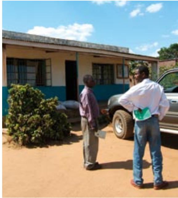
NASFAM is a key partner in the project

To aid learning during the project’s pilot phase, Malawi’s leading insurance